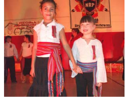
Members of Apsishiwak dance group