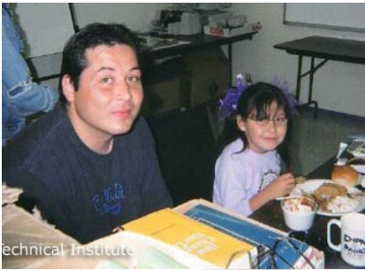
Photograph during a potluck meal at one of the DTI classrooms